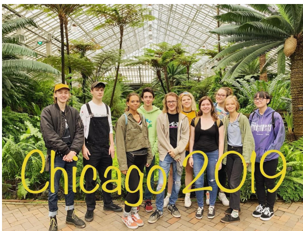
Students enjoying the Deep Dishing in Chicago Intensive.