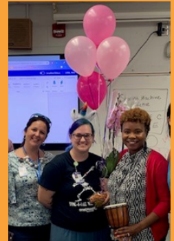
School-Related Employee of the Year -