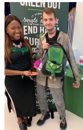
Celebrating Green Dot